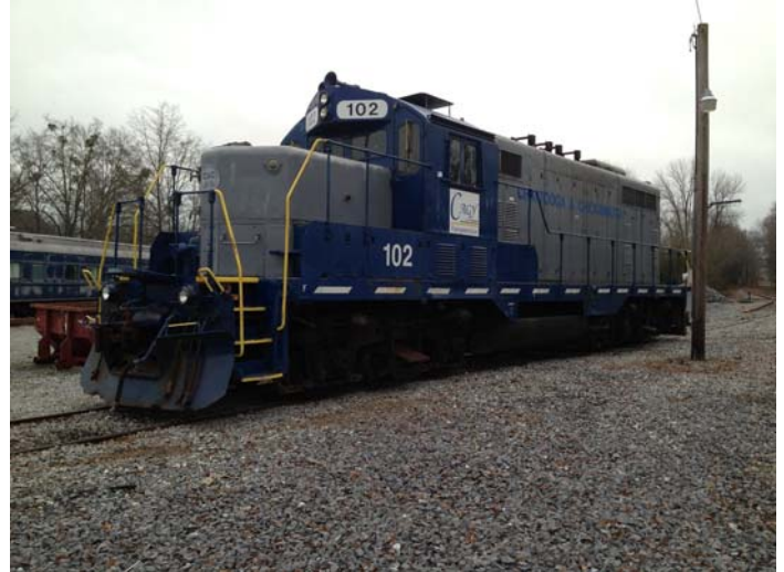
Former Columbus & Greenville GP7 seemed to be in operable condition the same day at LaFayette.