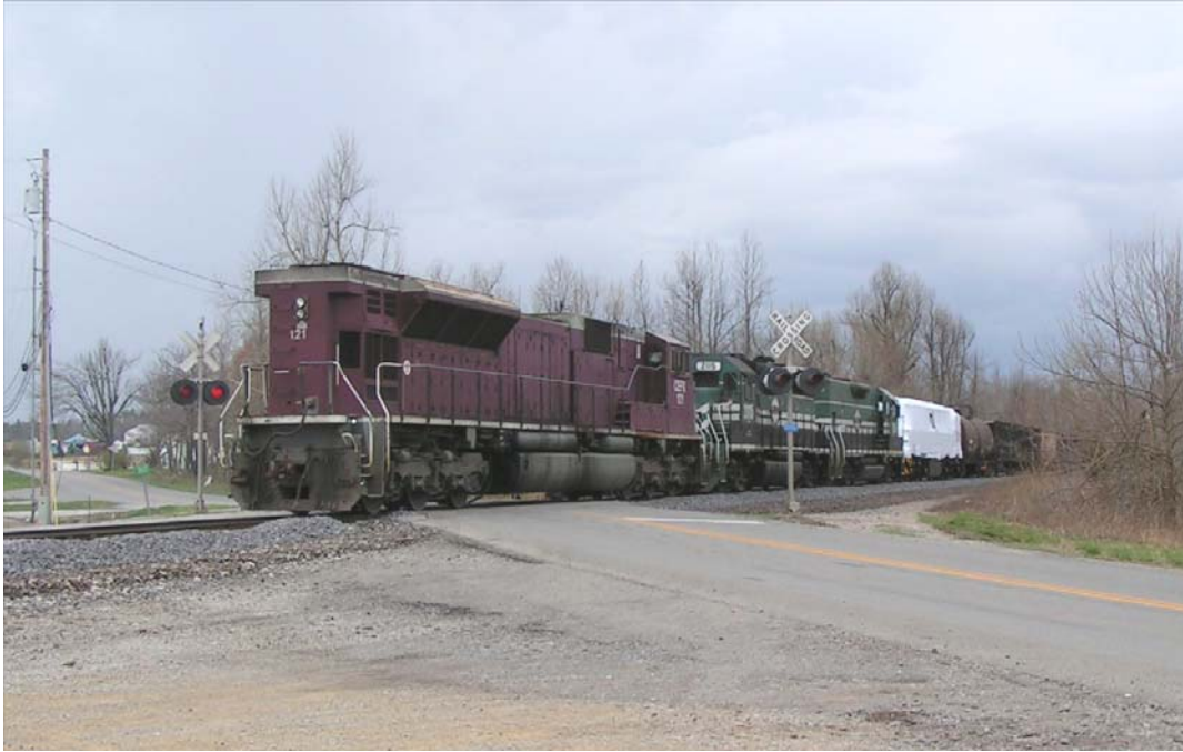
P&L East bound on March 15th at West Yard running long hood forward and with a new NRE locomotive in tow.