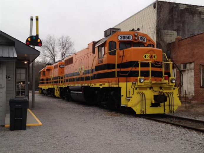
Great classic lines here on this EMD GP38 at LaFayette, GA, December 2011. In Georgia the accent falls on "Fay" in LaFayette.